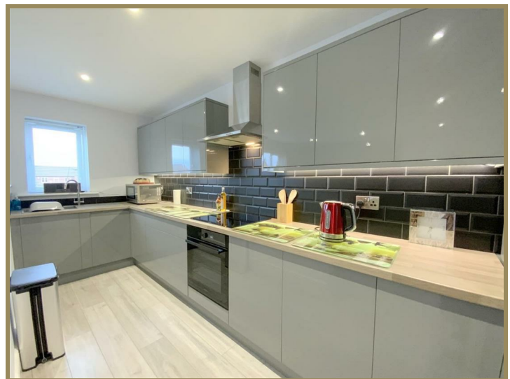
4 Roy's Drive, Tetney, DN36 5FS £196,000